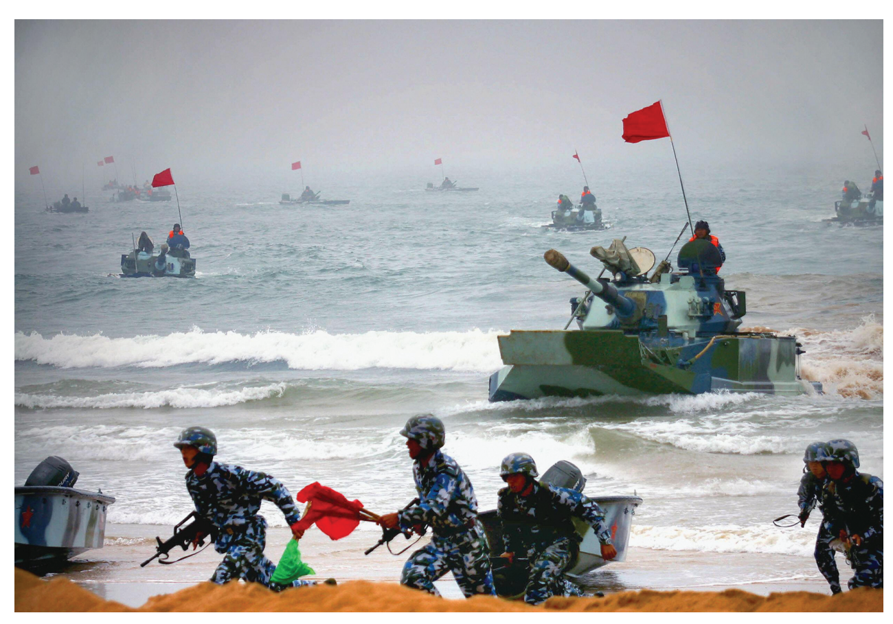
Joint Chinese and Russian military exercises, Shandong Peninsula, August 24, 2005. The People's Liberation Army (PLA), together with the people's militia and the People's Armed Police, form the basis of the armed forces in China. At the turn of the twenty-first century, the PLA has embarked on an aggressive modernization campaign, investing in new weapons systems and conducting military training exercises with neighboring countries.

reserve units. The 1997 National Defense Law states that the PLA has a "defensive fighting mission, [but] when necessary, may assist in maintaining public order in accordance with the law." The PAP, which is primarily responsible for domestic security, officially numbers about 660,000 personnel, though another 230,000 PAP personnel may be under the daily command of the Ministry of Public Security. The primary militia consists of about 10 million personnel and is tasked to provide support to both the PLA and PAP. The PLA is divided into the ground forces, the People's Liberation Army Navy (PLAN), the People's Liberation Army Air Force (PLAAF), and the strategic-missile forces (Second Artillery). At least 200,000 PLA coastal and border-defense units and roughly 100,000 PAP troops are responsible for border defense. All elements of the Chinese armed forces engage in societal activities (e.g., disaster relief and some infrastructure development). An unknown number of civilians (technical specialists, administrative and custodial staff, administrative contractors, and local government-paid staff) also support PLA operations.