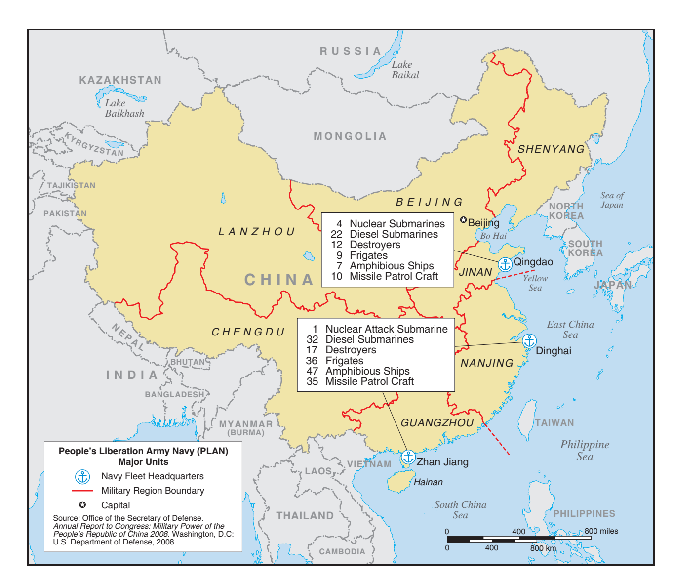
People's Liberation Army: Overview

2003–2004 downsizing included 200,000 troops, of which 170,000 (85%) were officers ( People's Daily 2006).