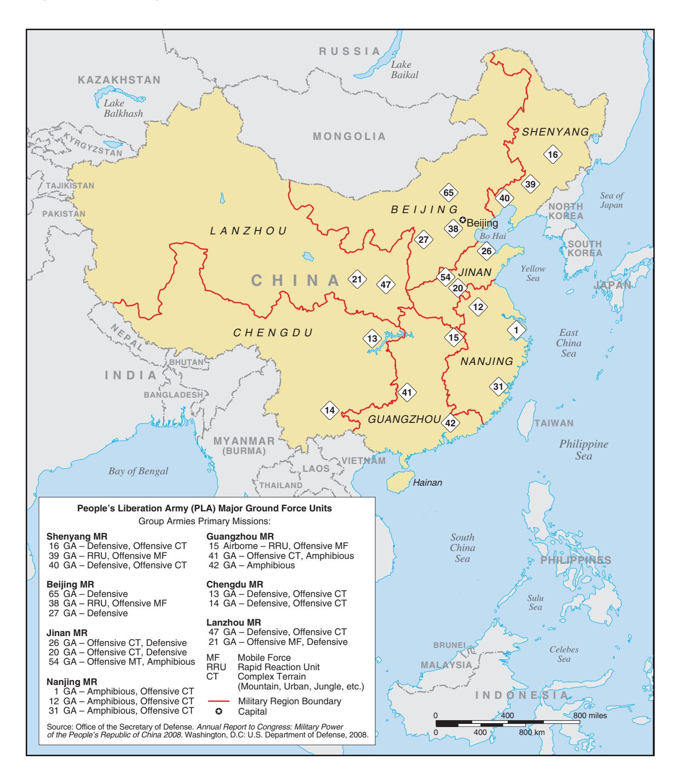
People's Liberation Army: Overview

In 2008 the PLAN commander, Admiral Wu Shengli, together with coequal political commissar, Admiral Hu Yanlin, led approximately 290,000 personnel in submarine, surface, naval aviation, coastal defense, and marine corps units, as well as ten institutions of professional military education. Personnel include 25,000 naval aviation personnel in seven divisions