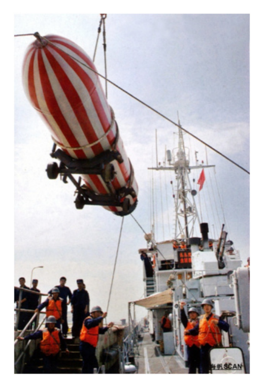
Photo 4. Laying a Training Bottom Mine. A crane, adequate deck space, GPS, and a low sea state are the conditions required to lay mines such as this bottom mine exercise shape.

simplicity of command and control. Disadvantages include a lack of stealth, limited speed, and consequent vulnerability.<sup>186</sup>