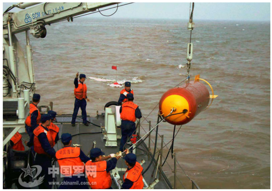
Photo 12. Minesweeping Exercise. Crewmembers on a PLAN East Sea Fleet mine countermeasures ship handle a towed noisemaker used to sweep acoustically triggered mines in May 2008. Already in the water is a marking buoy. Mine rails are visible on the deck to the right of the crane.

how the advent of GPS technologies could enhance the future effectiveness of MIW if this technology enables much more accurate laying of fields (or MIW operations by less experienced cadres), as well as the transmission of information on the parameters of those fields to friendly units.<sup>385</sup> Mentions of GPS-related training activities in PLAN reports, including MIW and MCM exercises at night and in bad weather, may indicate that this new technology could become a significant MIW enabler.<sup>386</sup> This may also be suggested by a minesweeper unit's development of a "recording instrument" that "raises the accuracy and battle operations capacity of sea mine sweeping and laying."<sup>387</sup>