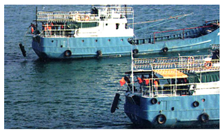
Photo 6. People's Militia Laying Mines. These two civilian fishing vessels, which are ubiquitous in the seas around China, practice deploying bottom mines as part of a larger "People's Militia" exercise at the PLAN base in Sanya in December 2004. Such exercises occur regularly at various PLAN bases. GPS would allow accurate placement of mines in defensive minefields around Chinese ports, even by militia forces such as these.

Complementing the robust capabilities described above are the thousands of Chinese fishing and merchant vessels that could be pressed into service. In 2003, Rong Senzhi, Deputy Commander, Yantai Garrison District, advocated in a journal affiliated with the Academy of Military Science that civilian vessels be utilized for minelaying and mine-sweeping.<sup>213</sup> China's 2008 defense white paper lists "mine-sweeping and mine-laying" as one of four primary PLA Navy Reserve forces.<sup>214</sup> According to one article, "China currently has 30,000 iron-hulled mechanized fishing trawlers (each vessel can carry 10 mines), and there are another 50,000 sail-fishing craft (each can carry 2–5 sea mines)."<sup>215</sup> Science of Campaigns (2006) is quite explicit on this point: "Mine-laying missions are usually assigned to submarine and aviation forces with relatively good concealment, but privately owned boats can also assume . . . mine-laying missions."<sup>216</sup> Chinese writings frequently mention the incorporation of civilian shipping into naval service for such