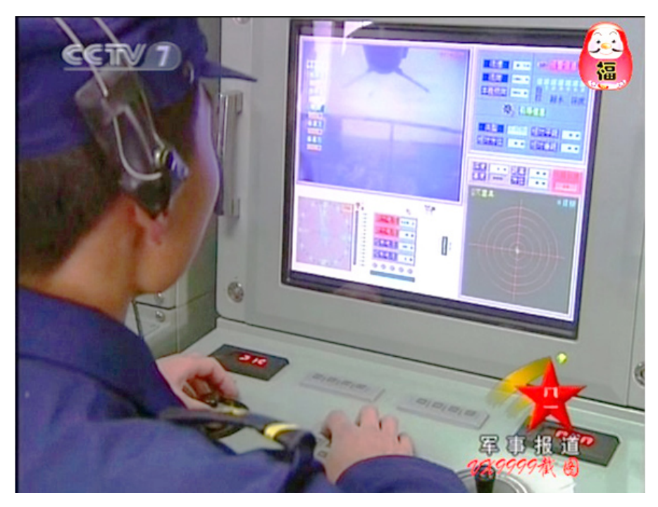
Photo 10. Console on Mine Countermeasures Ship. This operator's console, probably from Mine Countermeasures Ship 804, features a joystick and the ability to observe camera images remotely. It could be the location from which the mine-hunting UUV previously pictured is operated.

Some exercises have assumed "that 'enemy vessels' had mined a certain sea area to block our warships from passing."<sup>315</sup> MCM and MIW assets seem to be virtually interchangeable, in that PLAN minesweepers regularly practice laying mines.<sup>316</sup> Minesweeper ship training has recently included "daytime deep water minesweeping," "nighttime minesweeping," and "passing through a composite minefield" for single ships.<sup>317</sup>