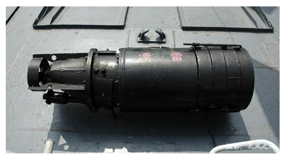
Photo 3. Piao Drifting Mine. The PLAN has produced large numbers of free-floating mines, although the current status of production, inventory, and deployment is unclear.

developed a third-generation drifting mine, the Piao-3, that oscillates at a depth of between two and seven meters.<sup>87</sup> Such drifting mines might be particularly useful for denying surface vessels access to waters east of Taiwan, particularly those too deep for rising mines.