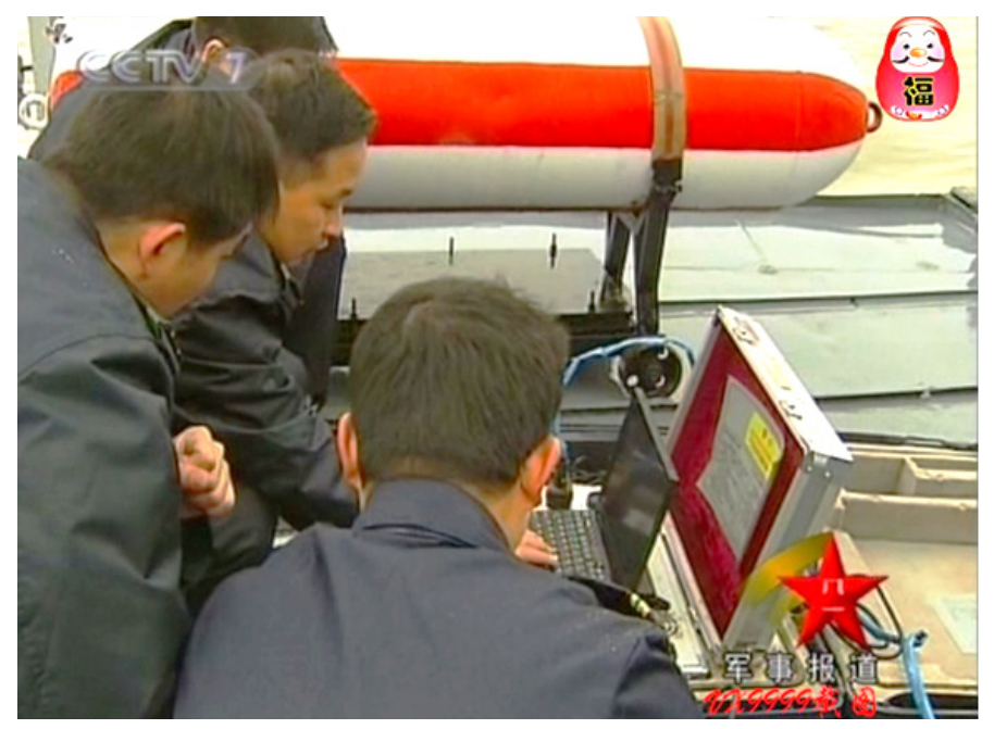
Photo 11. Exploiting Information Technology. Chinese technicians use a computer, with an exercise mine in the immediate background. Computers could greatly increase the accuracy of mine allocation, placement, and feature settings (such as activation delay, ship counters, and other variables), thereby optimizing their effectiveness.

mine technology in all aspects of their work, including monitoring inventories, repairing, and discarding obsolete weapons.<sup>369</sup> The PLAN Ordnance Support Department has issued and implemented further regulations such that "the time to rotate from one mine war-readiness level to another has been reduced."<sup>370</sup> As of 2008, for one South Sea Fleet sea mine depot