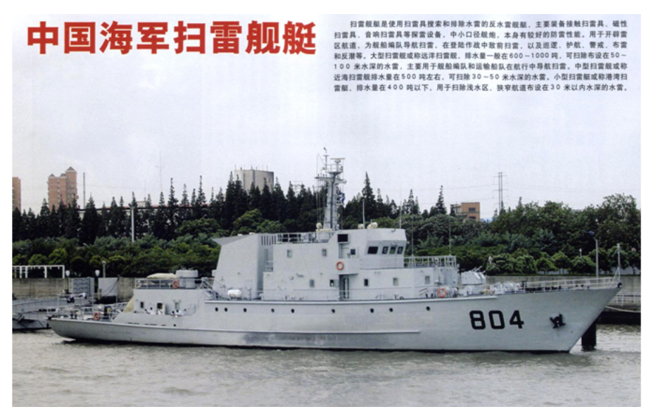
Photo 9. PLAN Mine Countermeasures Ship 804. This is one of China's most modern mine countermeasures ships. This ship has exercised with a remotely operated mine-hunting underwater unmanned vehicle and using what appear to be sophisticated, high-frequency active digital sonars.

operated mine-hunting underwater unmanned vehicle, described as a "new type of mine clearing device" and using what appear to be sophisticated, high-frequency, active digital sonars.<sup>303</sup>