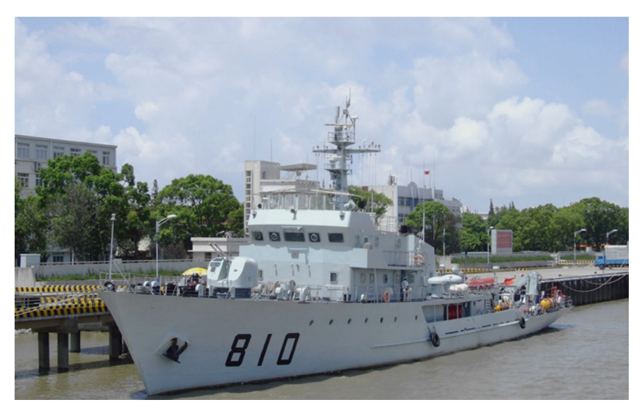
Photo 1. Wochi-Class Mine Countermeasures Ship. Jane's Fighting Ships lists six of these, which are apparently built at two shipyards, and mentions that they are similar to, but five meters longer than, the older T-43 Soviet-designed minesweepers that China built previously.

It would be a mistake to dismiss PLAN minesweeper development, however. Qiuxin Shipyard is reported to have launched a "new class" of six-hundred-ton minesweepers on 20 April 2004.<sup>71</sup> A daily newspaper published by the political department of the PLA's Guangzhou Military Region reports that in 2005 the PLAN made "achievements of development of training and operational methods for new equipment represented by new-type minesweepers."<sup>72</sup> Since 2005 the PLAN has taken delivery of two new, indigenously built types of MCM vessels: six of the Wochi class, and an as-yet single-ton Wozang class.<sup>73</sup> Of particular interest, China Central Television's military channel,