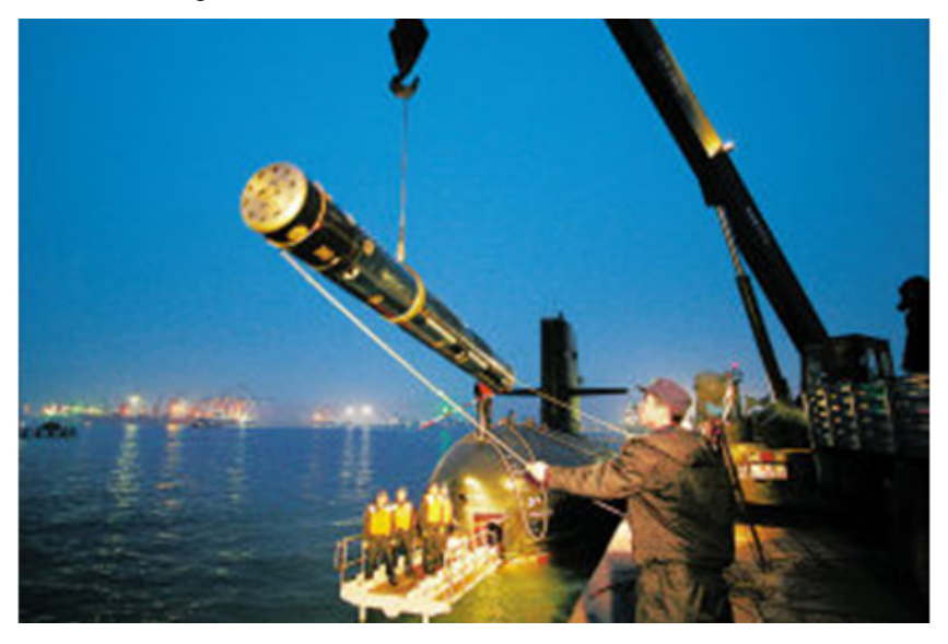
Photo 5. Submarine Mine. PMK-2 propelled mine being loaded onto Song-class diesel submarine at Qingdao.