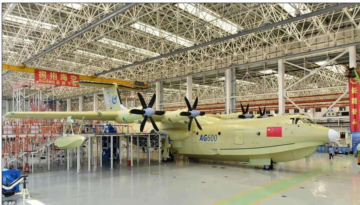
Figure 16. AG-600 Amphibious Aircraft