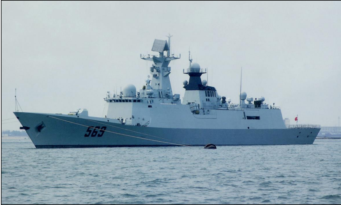
Figure 10. Jiangkai II (Type 054A) Class Frigate