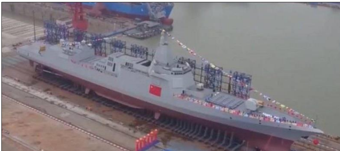
Figure 8. Renhai (Type 055) Cruiser (or Large Destroyer)