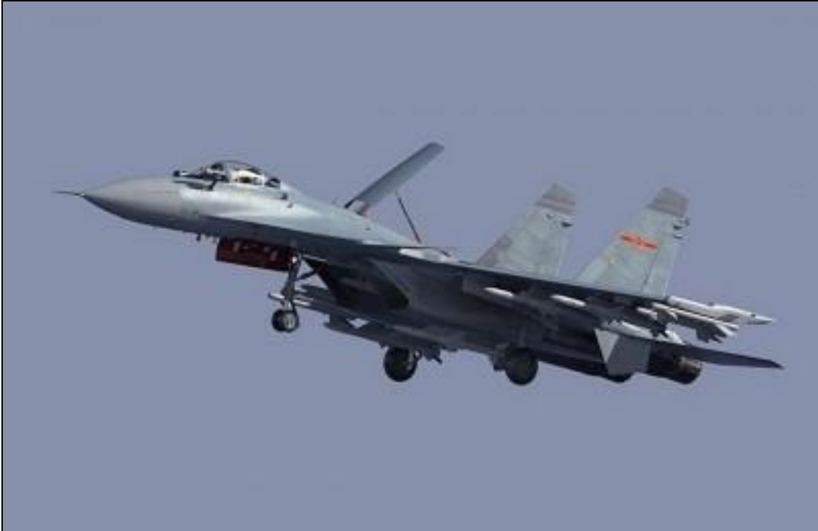
Figure 7. J-15 Carrier-Capable Fighter