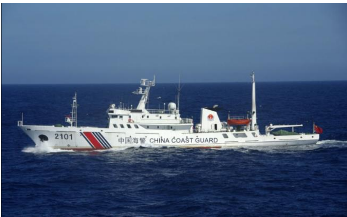
Figure 13. China Coast Guard Ship