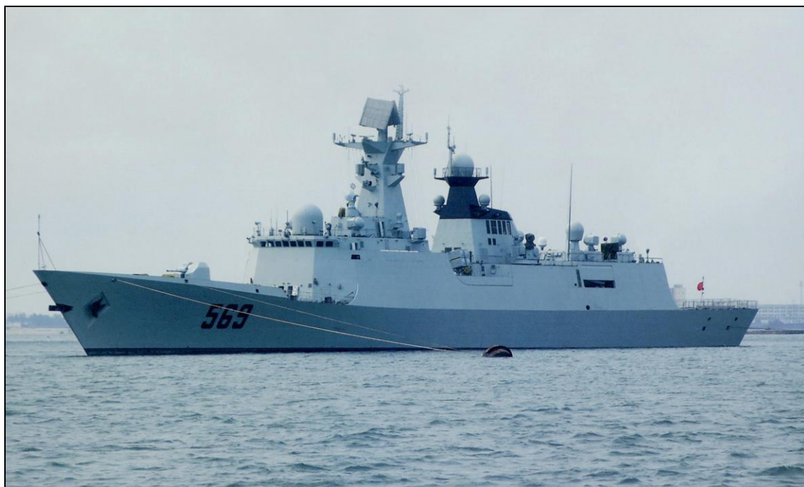
Figure 10. Jiangkai II (Type 054A) Class Frigate