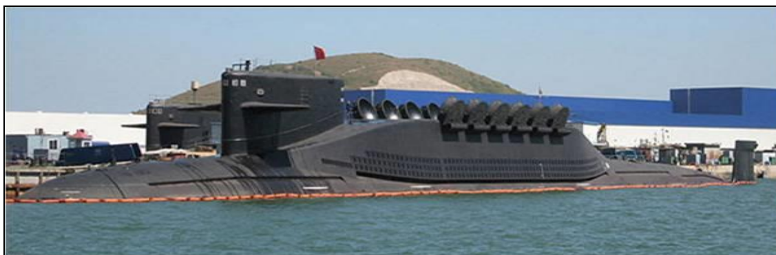
Figure 1. Jin (Type 094) Class Ballistic Missile Submarine