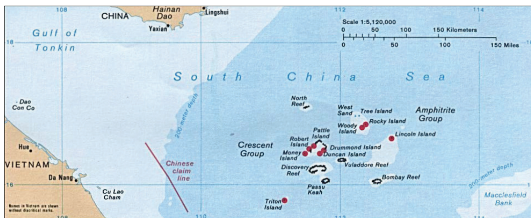
MAP 1 THE PARCEL ISLANDS