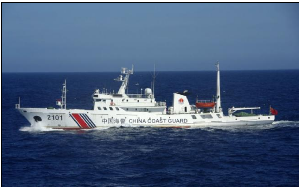
Figure 13. China Coast Guard Ship