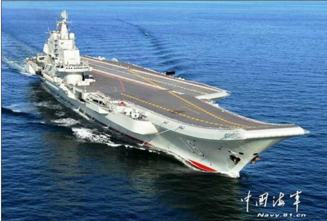
Figure 5. Liaoning (Type 001) Aircraft Carrier

This picture shows the ship during a sea trial in October 2012.