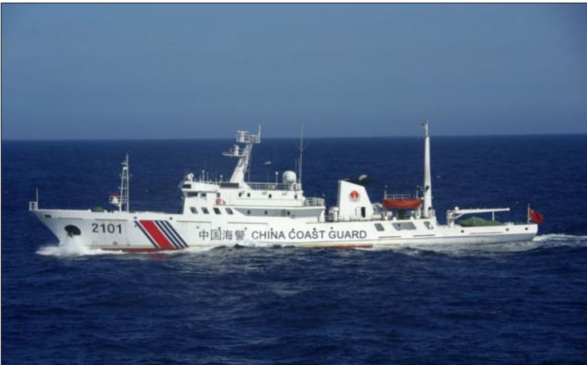
Figure 13. China Coast Guard Ship