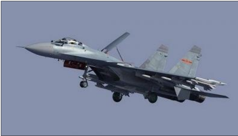
Figure 7. J-15 Carrier-Capable Fighter