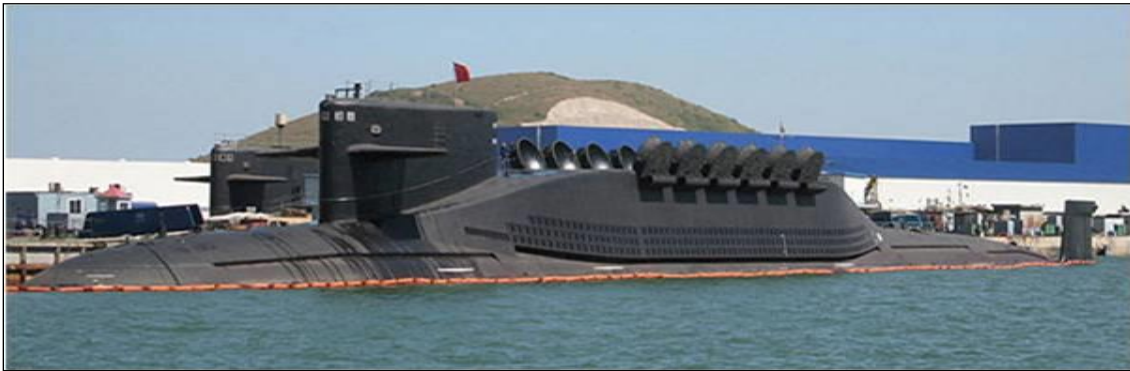
Figure 1. Jin (Type 094) Class Ballistic Missile Submarine