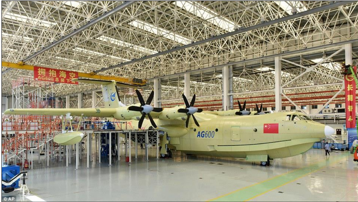
Figure 16. AG-600 Amphibious Aircraft