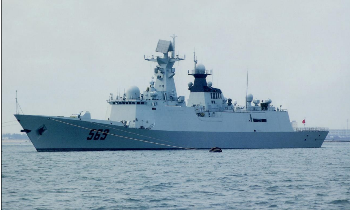
Figure 10. Jiangkai II (Type 054A) Class Frigate