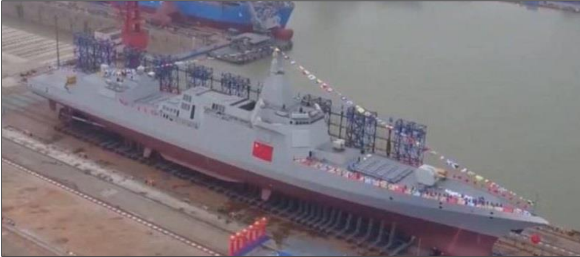
Figure 8. Renhai (Type 055) Cruiser (or Large Destroyer)