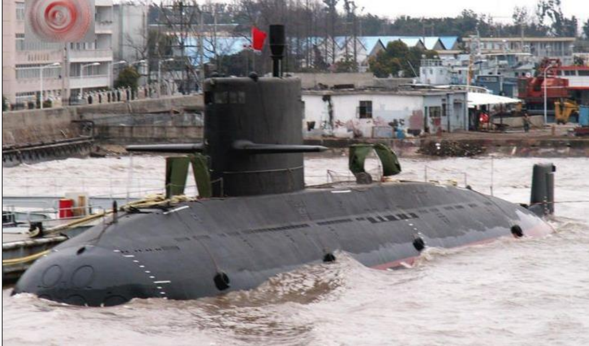
Figure 2. Yuan (Type 039A) Class Attack Submarine