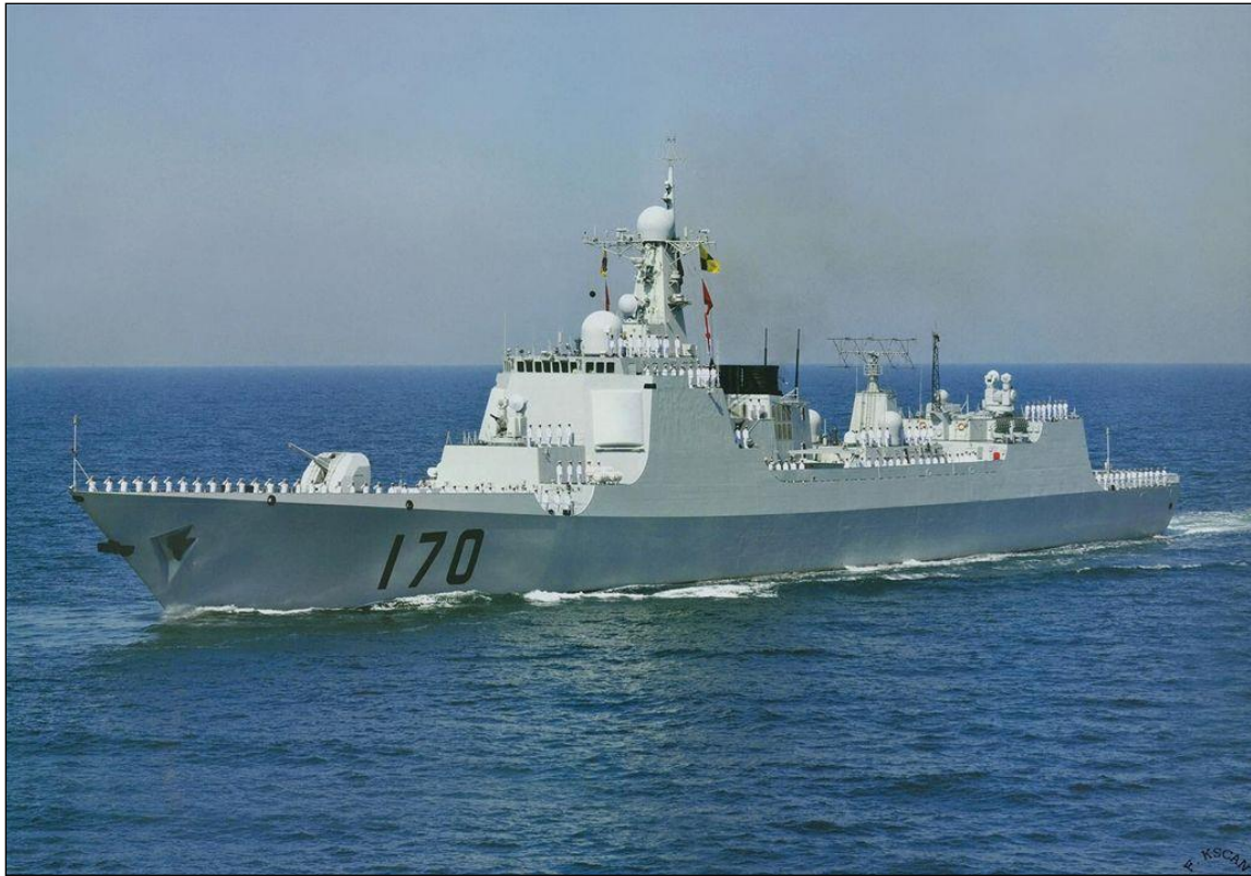
Figure 9. Luyang II (Type 052C) Class Destroyer