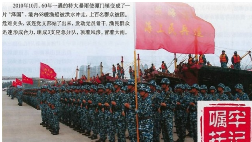
Maritime militia forces at review in Tanmen, Hainan, 2010 (file image)

2010年10月, 60年一遇的特大暴雨使潭门镇变成了一片“泽国”, 港内68艘渔船被洪水冲走, 上百名群众被困。危难关头, 该连党支部站了出来, 发动党员骨干、渔民群众迅速形成合力, 组成3支应急分队, 顶着风浪, 冒着大雨,