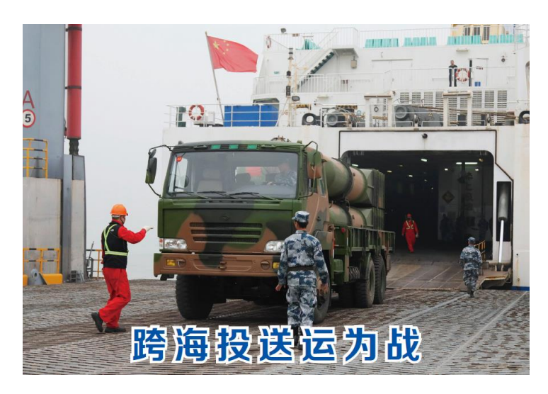
Image 3: PLAAF units load onto a RO-RO vessel of the strategic projection support ship fleet.<sup>51</sup>

These ships are also used to deliver ammunition to military units. Under direction of the Northern Theater Command, vehicles loaded with troops and various types of ammunition embarked aboard one of COSCO Shipping Group's RO-RO ships in September 2016 for transport to an island firing range. This was reportedly the first time the Northern Theater Command used civilian ships to transport ammunition.<sup>52</sup>