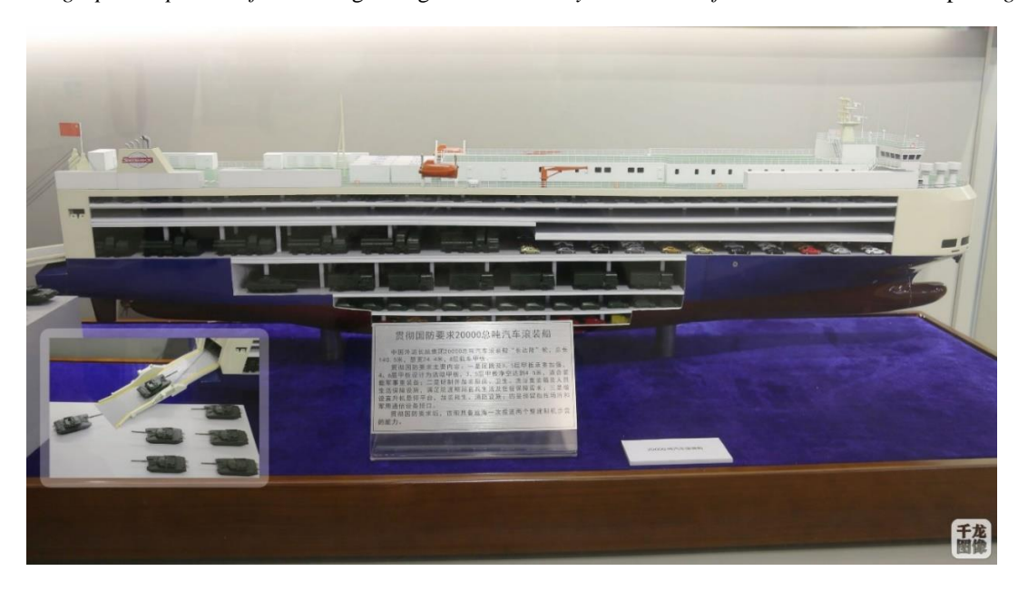
Image 2: A model of the Changdalong displayed at a 2017 exhibition in Beijing on the military's achievements. Sources indicate it can transport two mechanized infantry battalions and has spaces and facilities for command and living quarters to support long-distance transport to the far seas. Tanks and various military vehicles are depicted on its decks and containers to supplement living conditions for troops on board are shown on the top deck.<sup>46</sup>