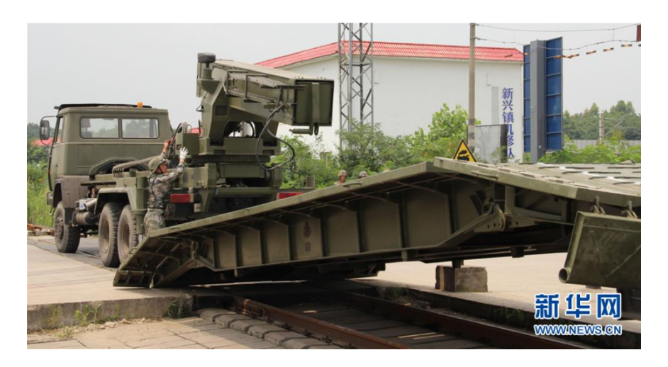
Image 10: A vehicle-mounted railway field platform used during the "Firepower-2015" trans-regional exercise. 122

Bridging the Bohai Gulf and Qiongzhou Strait with PLA rail transport connections provides important opportunities for PLA training and projection operations. One senior engineer from the CMC Logistics Department explained in 2016 that demand for unit training in maritime projection will increase in the future. He stated that "the trial operations of cross-sea railway ferry transports for