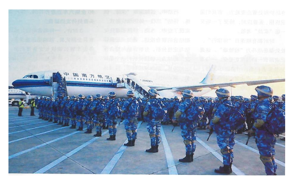
Image 7: This released photo shows troops embarking aboard a China Southern Airlines aircraft during a PLAN Marine Corps-wide trans-regional long-range projection training exercise held in March 2018. 92

sick personnel, and rapidly delivering materials and equipment. <sup>90</sup> Recent efforts have included increasing service to remote areas to satisfy requirements for high-elevation and island transport and projection. <sup>91</sup>