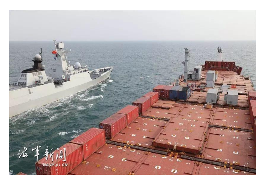
Image 4: Sinotrans & CSC container vessel Fuzhou conducts dry cargo alongside replenishment tests with the Linyi in November 2019.