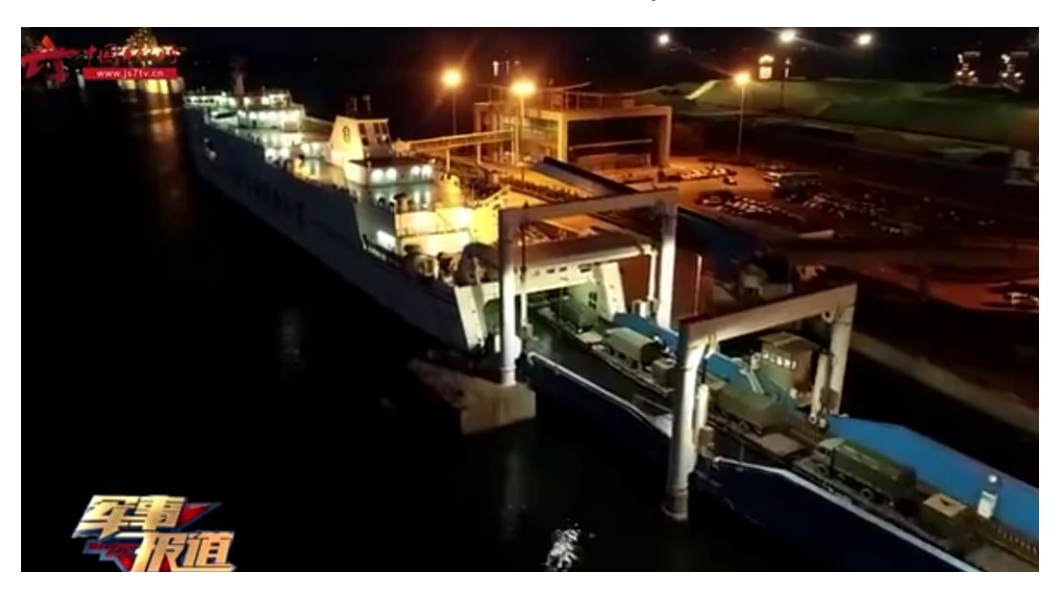
Image 8: PLANMC units transported by railway ferries in July 2019.

In July 2019, a PLAN Marine Corps (PLANMC) combined arms unit utilized nine ferries, including those from the Eighth Transport Dadui and rail-car ferries operated by China Railway Bohai Railway Ferry, to transit armor, artillery, support vehicles and personnel across the Bohai Gulf to Dalian. Among the reported advantages of this approach was improved operational security: keeping military units at sea reduced the attention drawn to unit movements by road closures. <sup>120</sup>