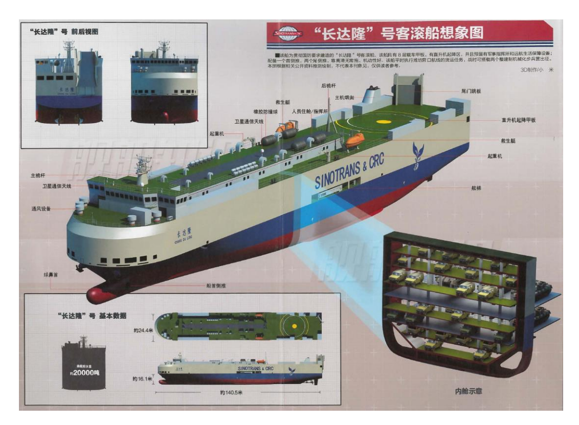
Image 1: A graphic depiction of the Changdalong in the February 2019 issue of Naval & Merchant Ships magazine.