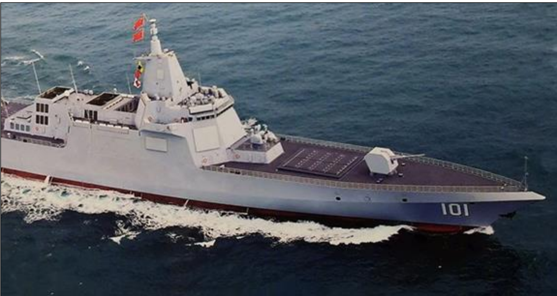
Figure 14. Renhai (Type 055) Cruiser (or Large Destroyer)