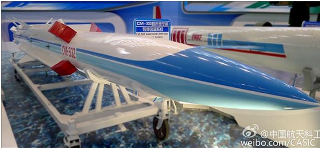
Figure 3. Reported Image of Anti-Ship Cruise Missile (ASCM)

(The article states “This is an article published in our December 2016 Issue.”) The article states “According to Chinese news media reports, the China Aerospace Science and Industry Corporation(CASIC) CM-302 missile is being marketed for export as “the world’s best anti-ship missile.” The missile was showcased at the Zhuhai air show in the southern People’s Republic of China (PRC) in early November [2016], and is advertised as [a] supersonic Anti-Ship Missile (AShM) [ASCM] which can also be used in the land attack role. The report, published by the national newspaper China Daily , suggest[s] that the CM-302 is the export version of CASIC’s YJ-12 supersonic ASHm, which is in service with the PRC’s armed forces.”)