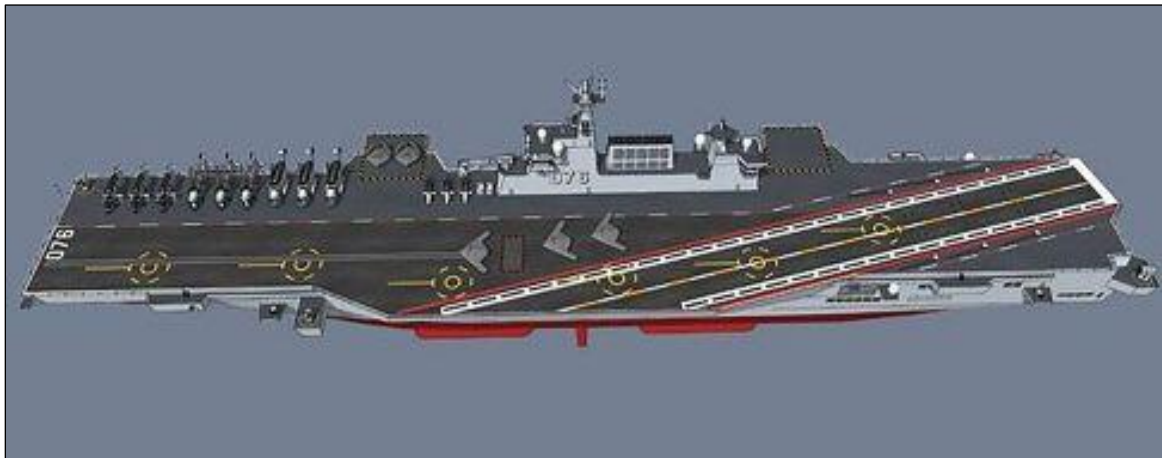
Figure 23. Notional Rendering of Possible Type 076 Amphibious Assault Ship