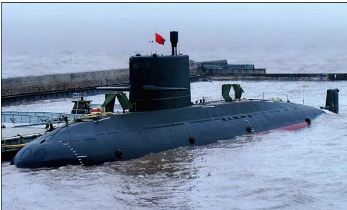
Figure 6. Yuan (Type 039) Attack Submarine (SS)