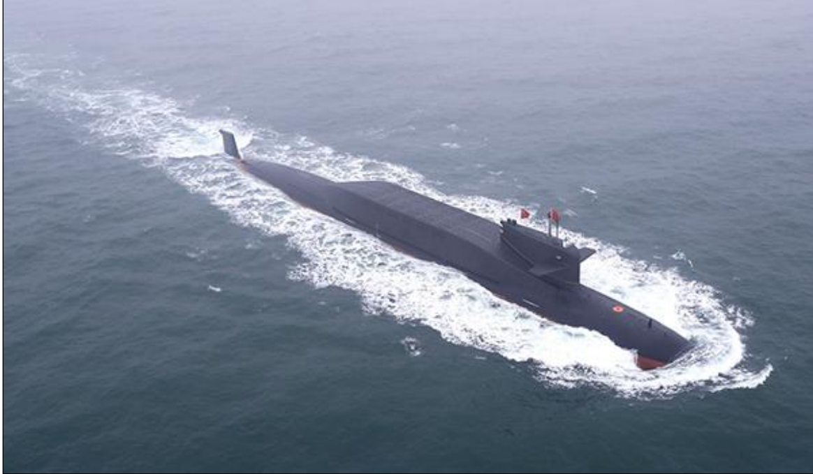
Figure 8. Jin (Type 094) Ballistic Missile Submarine (SSBN)