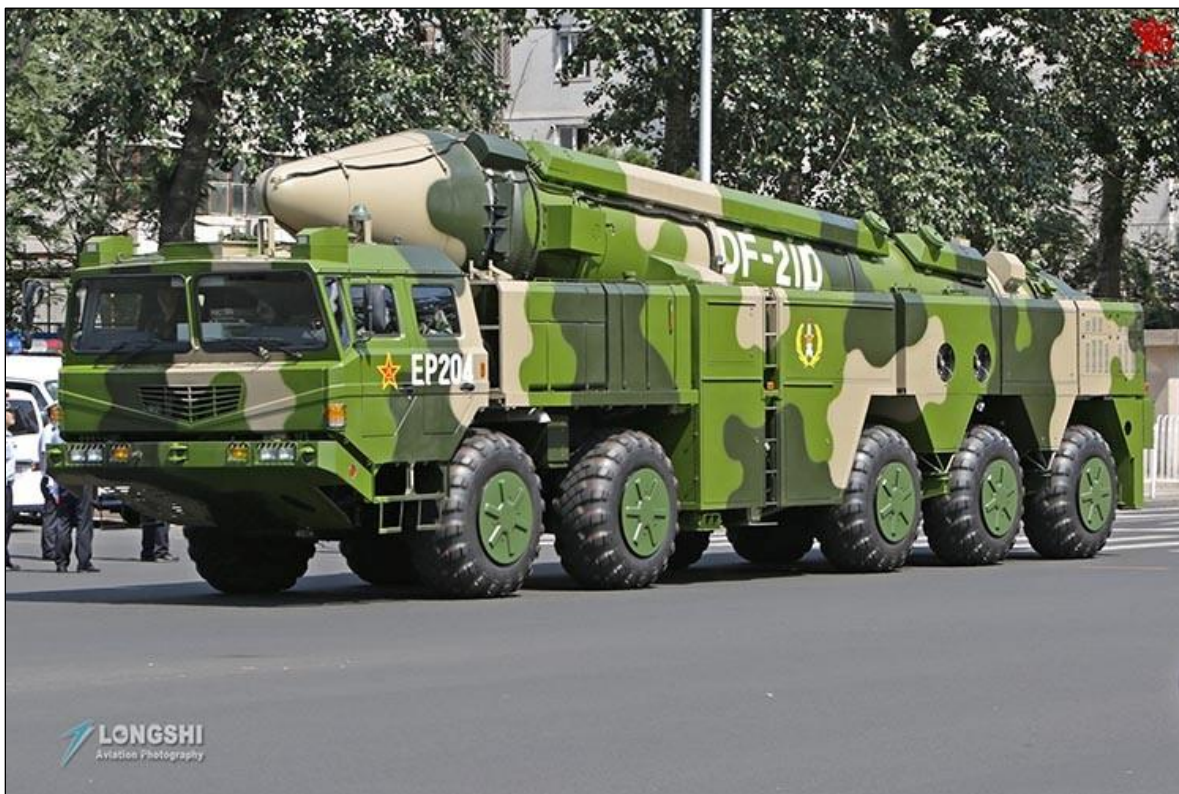
Figure 1. DF-21D Anti-Ship Ballistic Missile (ASBM)