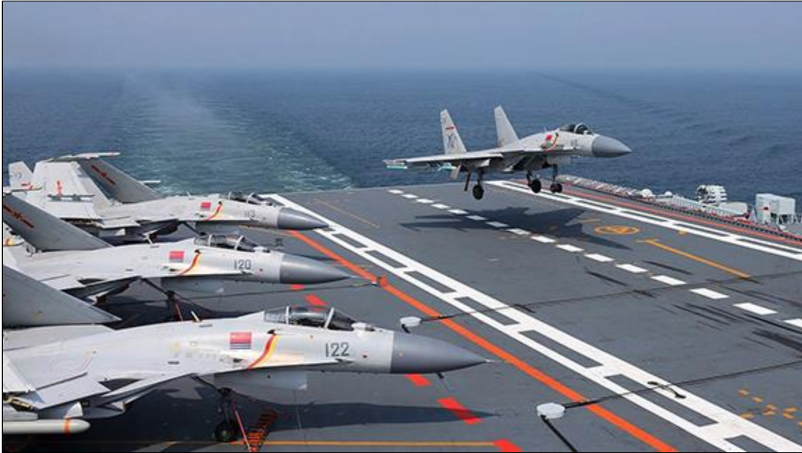
Figure 12. J-15 Flying Shark Carrier-Capable Fighter