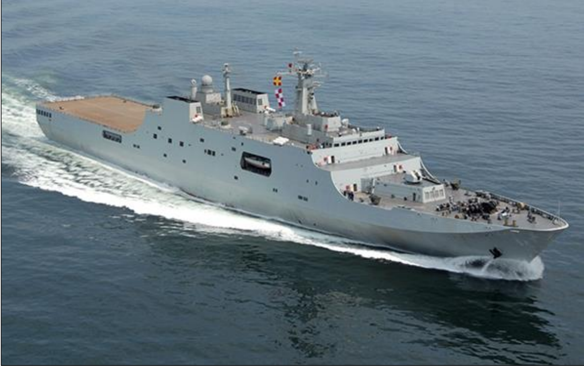
Figure 18. Yuzhao (Type 071) Amphibious Ship