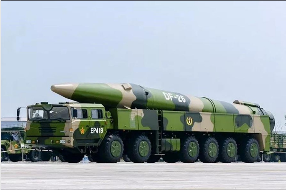
Figure 2. DF-26 Multi-Role Intermediate-Range Ballistic Missile (IRBM)