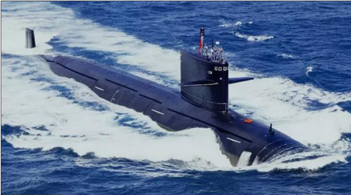
Figure 7. Shang (Type 093) Attack Submarine (SSN)