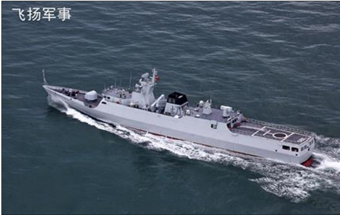
Figure 17. Jingdao (Type 056) Corvette