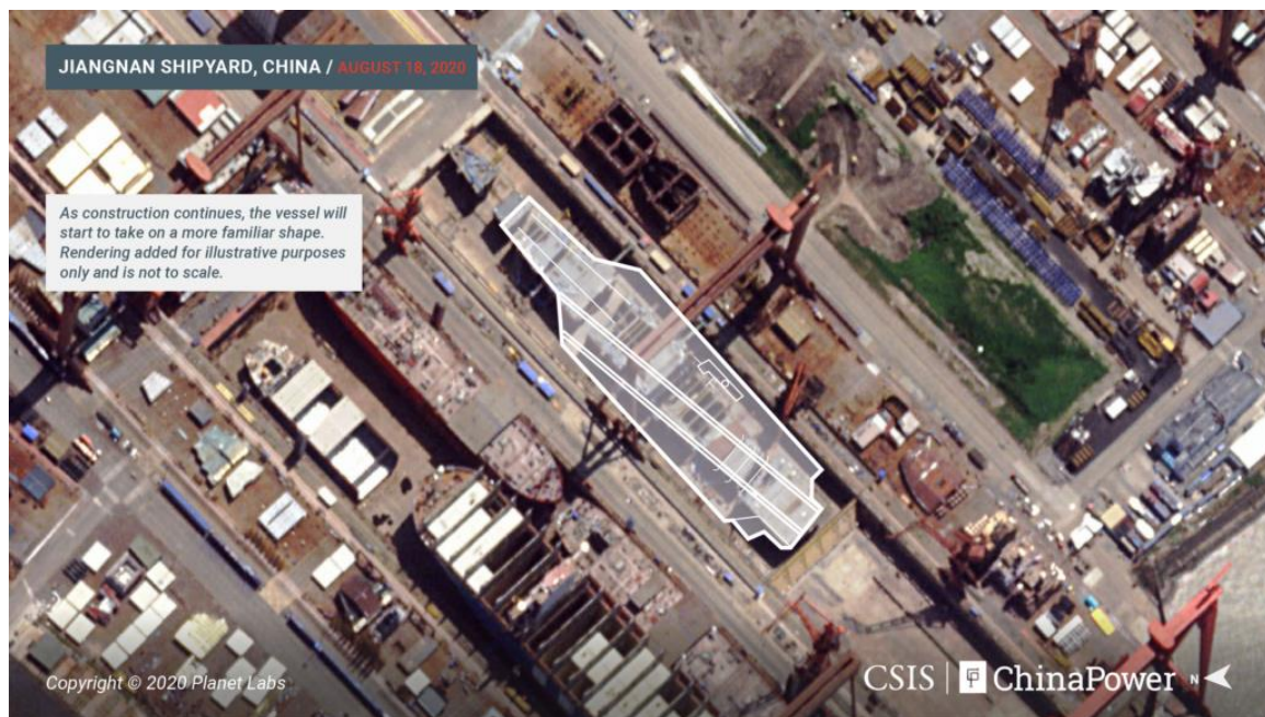
Figure 11. Type 003 Aircraft Carrier Under Construction