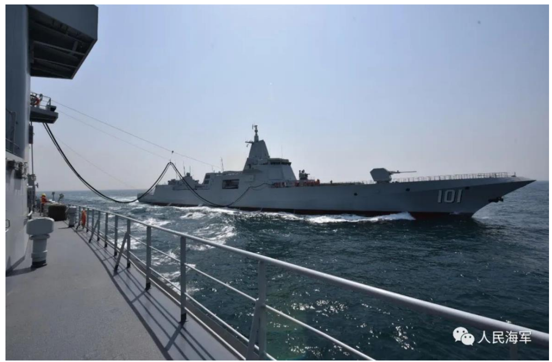
Exhibit 7. The Type 055 cruiser Nanchang completes its first at-sea subject evaluation. 142

The ship as a whole is evaluated on its ability to meet requirements for each training subject. Requirements are met through subject evaluations (科目考核), akin to "certification exercises" during Basic Phase training for U.S. Navy vessels. Some evaluations are conducted over multiple days at sea; others are done ashore in simulators. Some elements of these subject evaluations are extremely fundamental. For example, to evaluate seamanship crews are tested on their ability to pull into and depart from a pier. The crews of ships with deck guns are evaluated on their ability to employ them against shore and surface targets, both day and at night. The Nanchang 's first at-sea subject evaluation, which occurred in May 2020, four months after training began, was an underway replenishment.