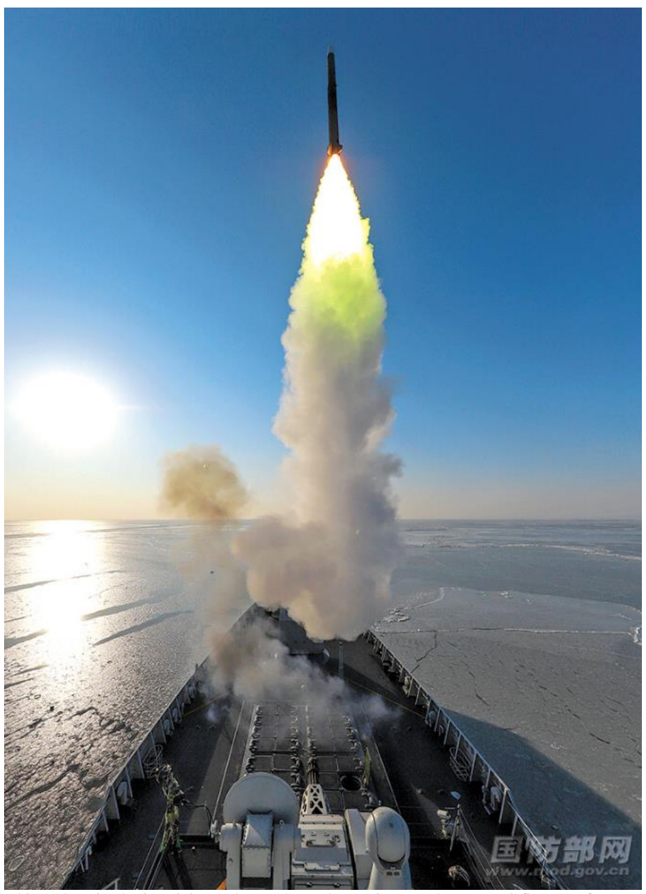
Exhibit 4. A ship undergoing basic training at the Northern Theater Command Navy VTC fires a surface-to-air missile.<sup>75</sup>

waters, navigating in heavy winds and high seas, man overboard recovery, navigating while under tow, use of small arms, and "damage control under combat conditions" (战斗条件下损管).<sup>74</sup>