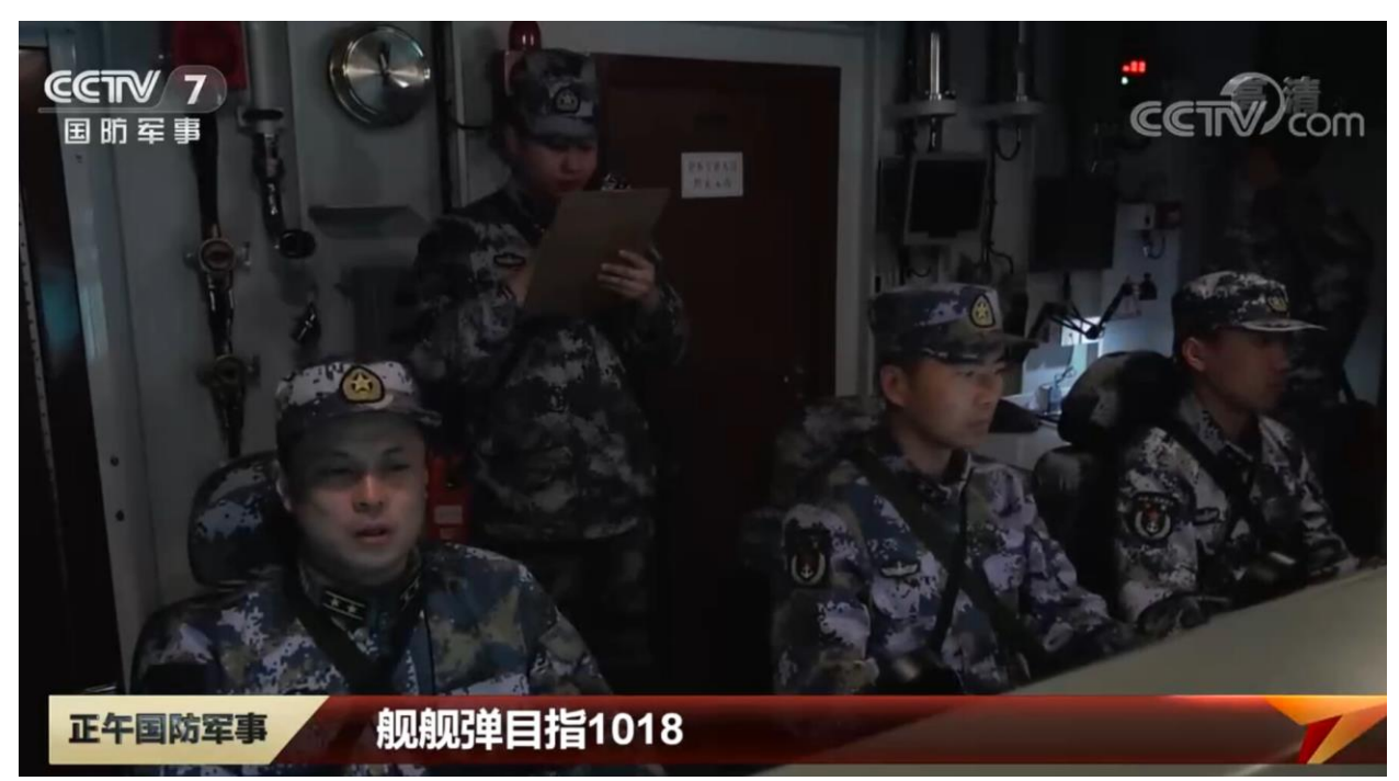
Exhibit 6. A Northern Theater Command VTC staff member observes at-sea training. 133