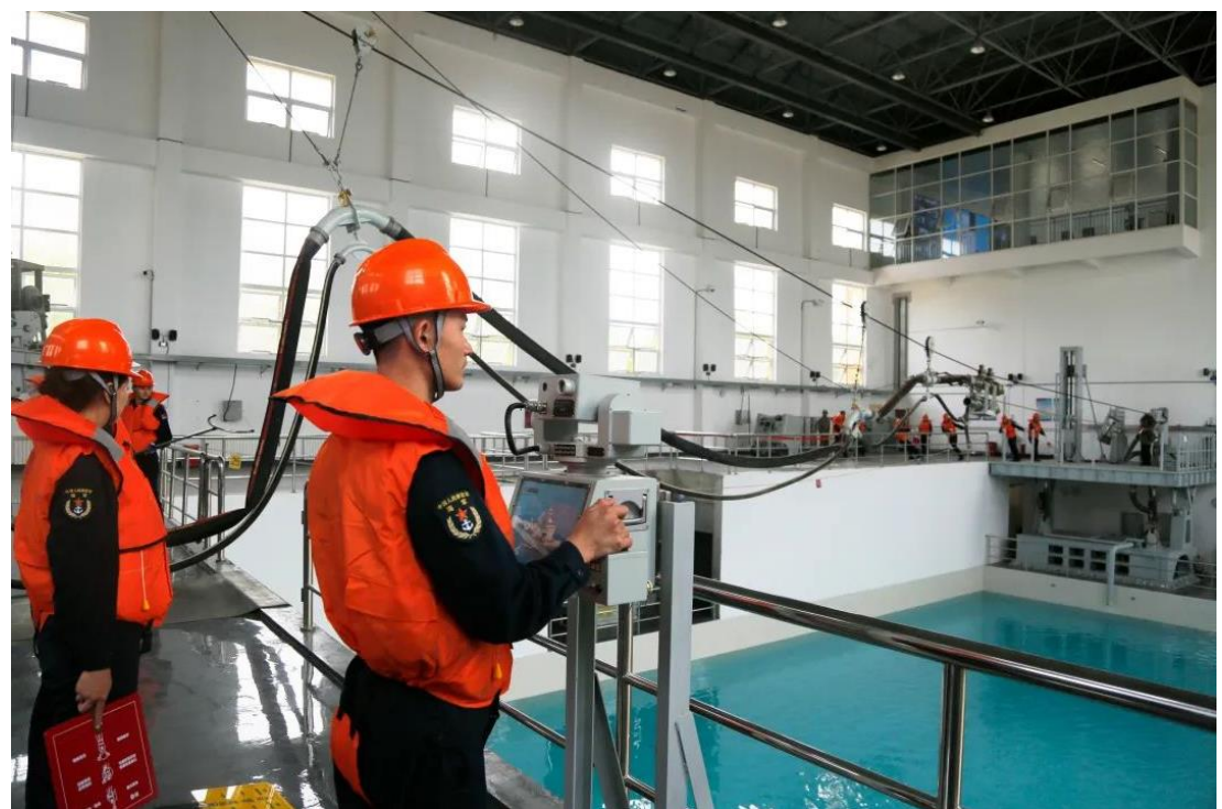
Exhibit 1. PLAN sailors train on an underway replenishment simulation system.<sup>61</sup>