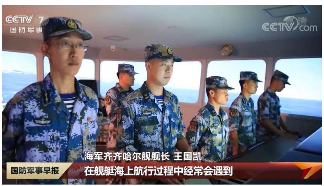
Exhibit 2. Crew members of the destroyer Qiqiha'er train in a bridge simulator at the Northern Theater Command Navy VTC.<sup>62</sup>