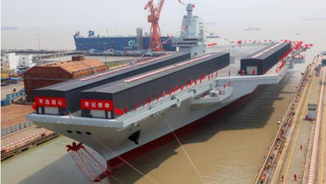
Figure 12. Fujian (Type 003) Aircraft Carrier