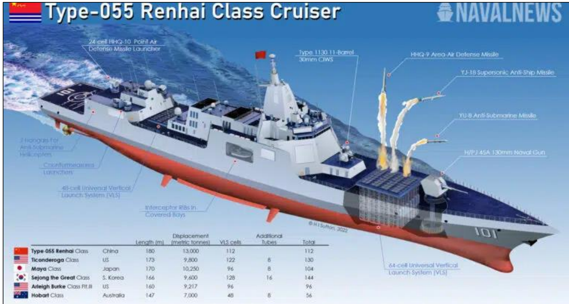
Source: Illustration accompanying H. I. Sutton, “Bigger Than A U.S. Navy AEGIS Cruiser: China Is Building More Type-055s,” Naval News , January 12, 2022.