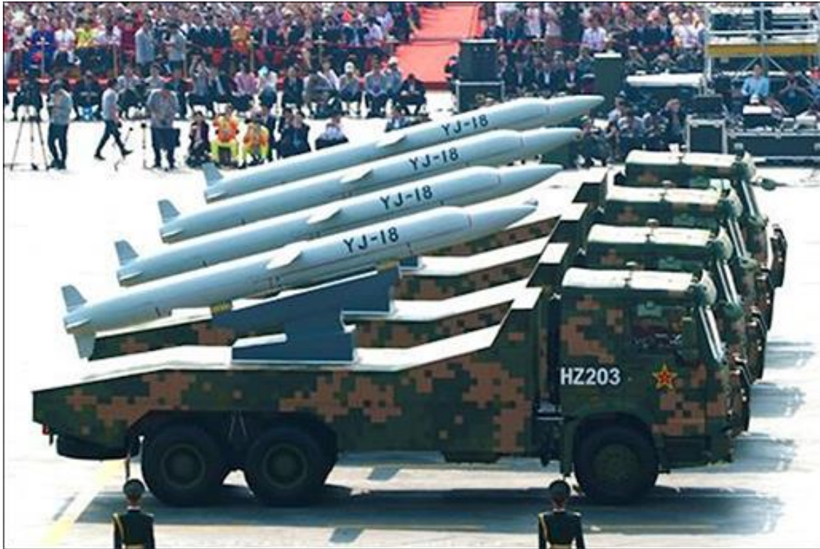
Figure 4. Reported Image of Anti-Ship Cruise Missile (ASCM)

The article states, “A grand military parade was held in Beijing on 01 October 2019 to mark the People’s Republic of China’s 70 th founding anniversary.... One weapon featured was a new generation of anti-ship missiles called YJ-18. China unveiled YJ-18/18A anti-ship cruise missiles in the National Day military parade in central Beijing.”