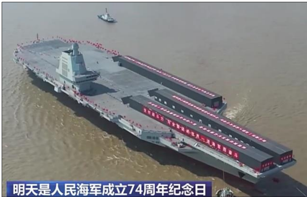
Figure 14. Fujian (Type 003) Aircraft Carrier

Source: Cropped version of photograph accompanying “Power, Mooring Tests of Aircraft Carrier Fujian Successfully Underway,” China Military Online , April 23, 2023. The caption to the photograph identifies it as a screen shot from a China Central Television video report.