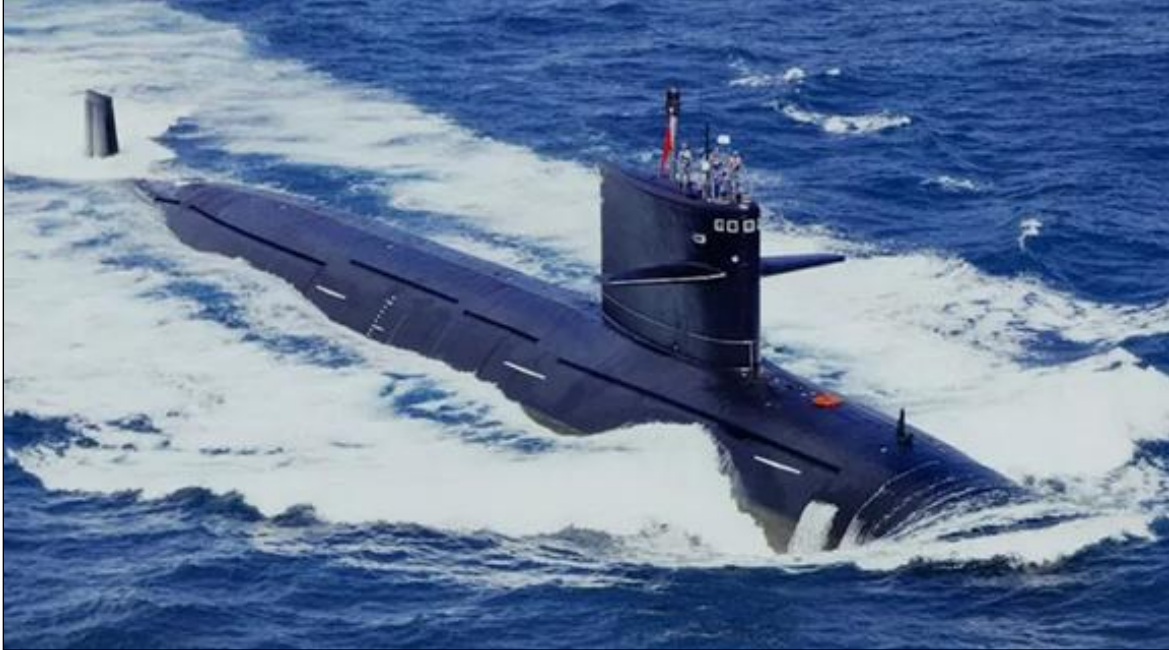
Figure 8. Shang (Type 093) Attack Submarine (SSN)