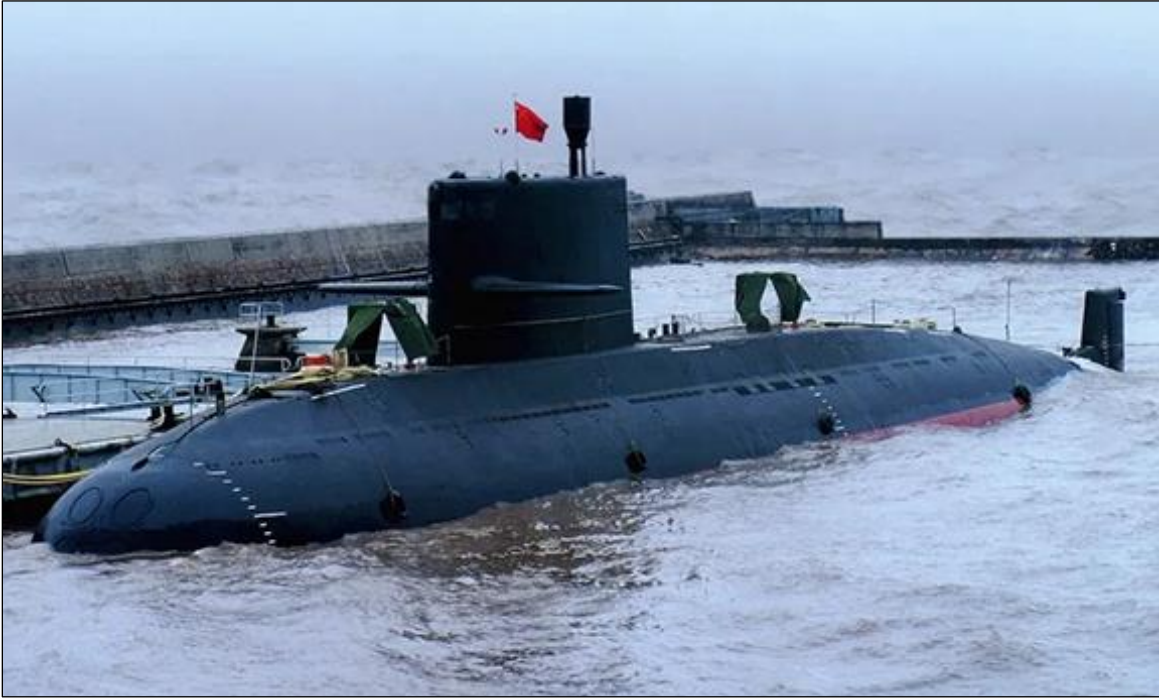
Figure 7. Yuan (Type 039) Attack Submarine (SS)