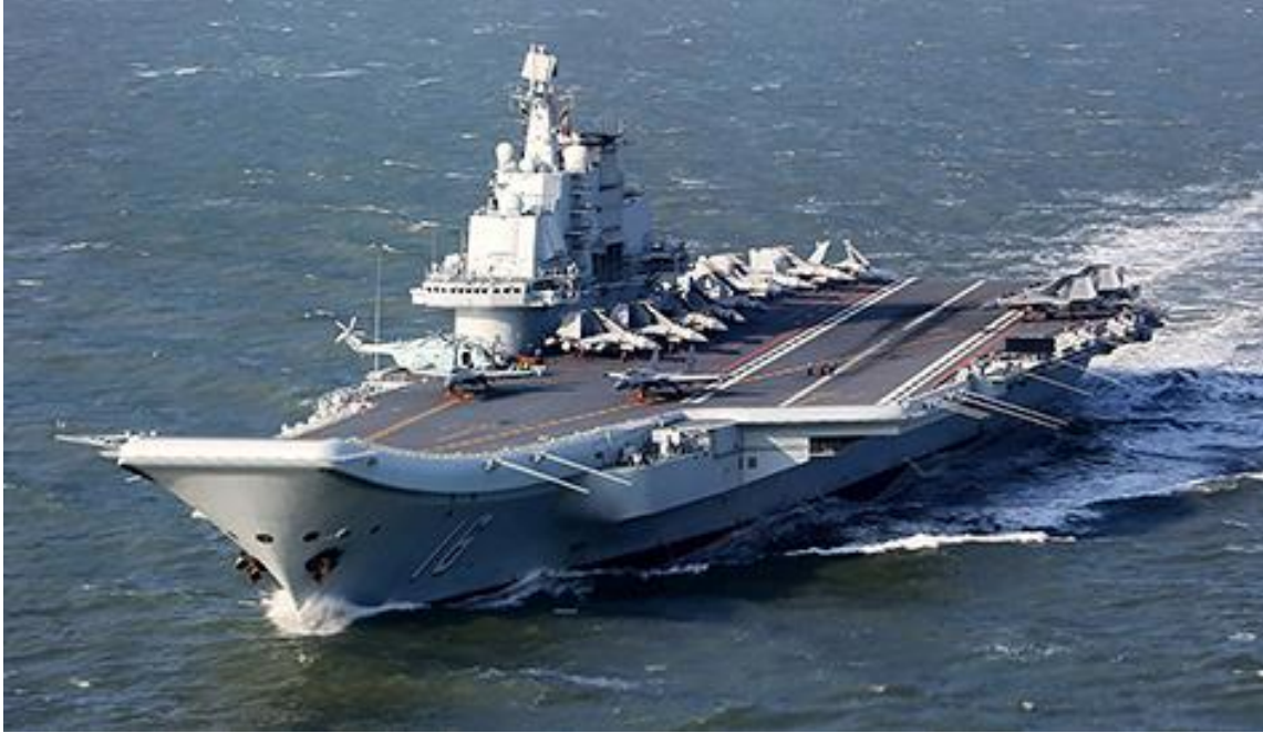
Figure 10. Liaoning (Type 001) Aircraft Carrier