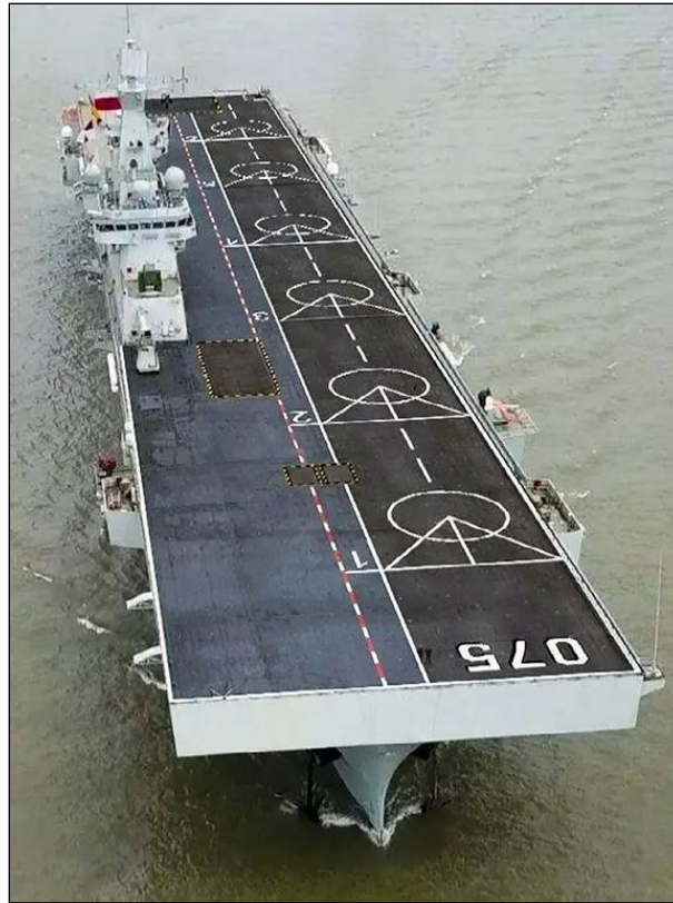
Figure 25. Type 075 Amphibious Assault Ship

Possible Type 076 Catapult-Equipped Amphibious Assault Ship.