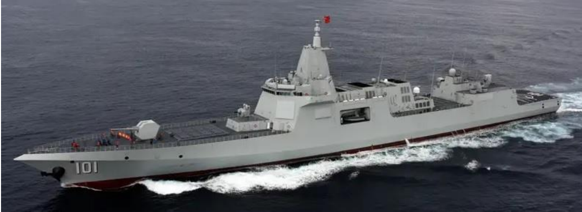
Figure 17. Renhai (Type 055) Cruiser (or Large Destroyer)