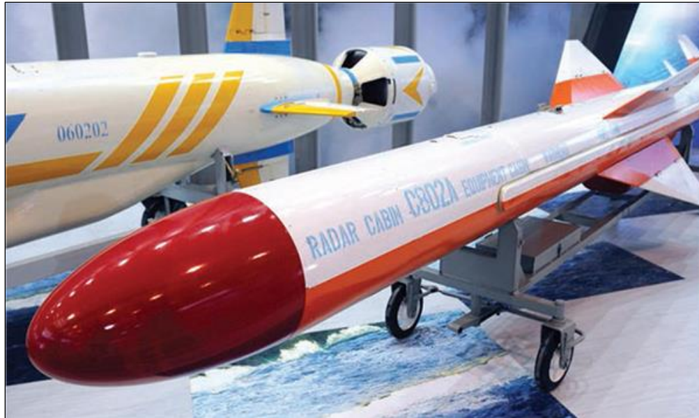
Figure 5. Reported Image of Anti-Ship Cruise Missile (ASCM)