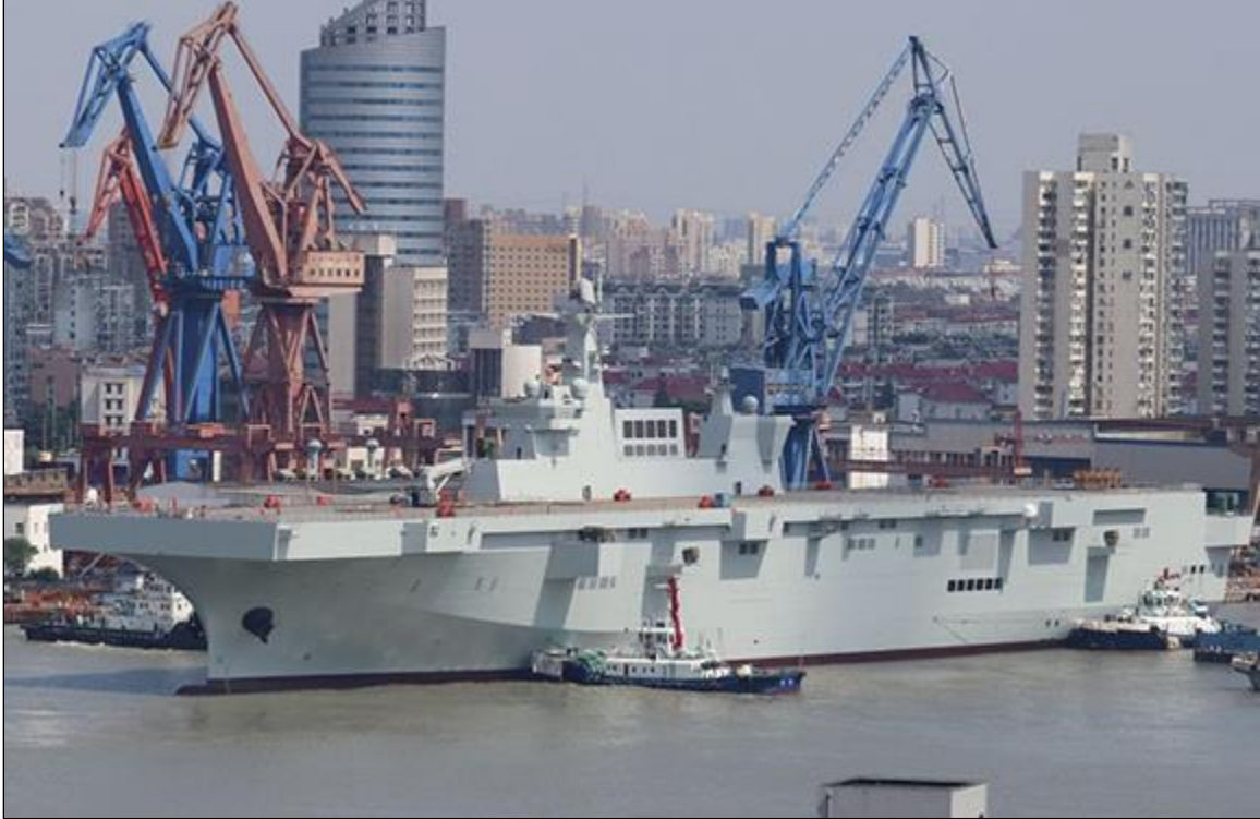
Figure 24. Type 075 Amphibious Assault Ship

Source: Photograph accompanying David Axe, “China Is Finishing Its First Large Helicopter Assault Ship,” National Interest , October 29, 2019.