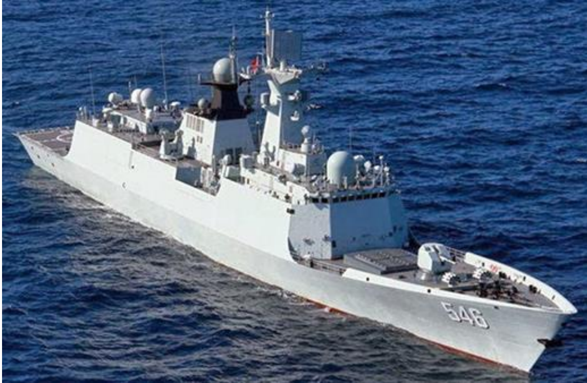
Figure 21. Jiangkai II (Type 054A) Frigate