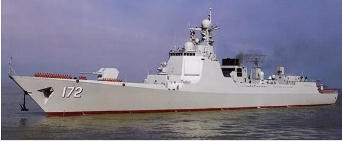
Figure 20. Luyang III (Type 052D) Destroyer