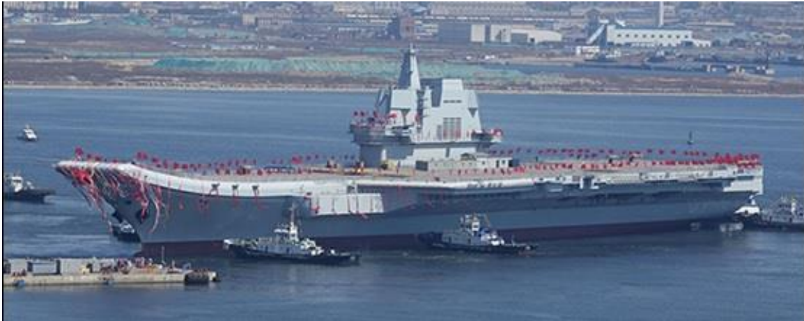
Figure 11. Shandong (Type 002) Aircraft Carrier