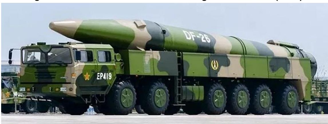
Figure 2. DF-26 Multi-Role Intermediate-Range Ballistic Missile (IRBM)