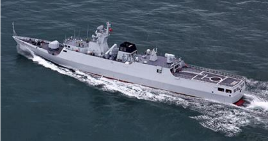
Figure 22. Jingdao (Type 056) Corvette