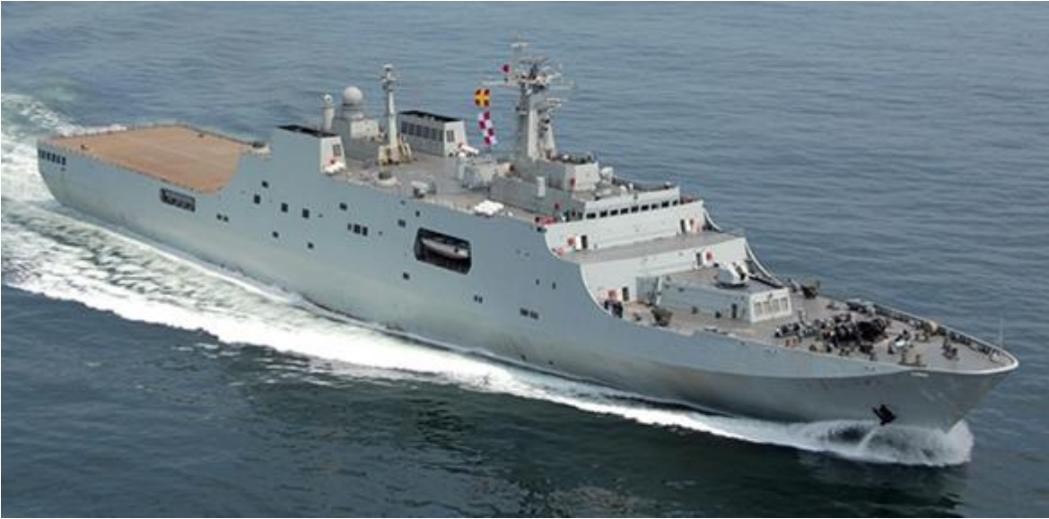
Figure 23. Yuzhao (Type 071) Amphibious Ship