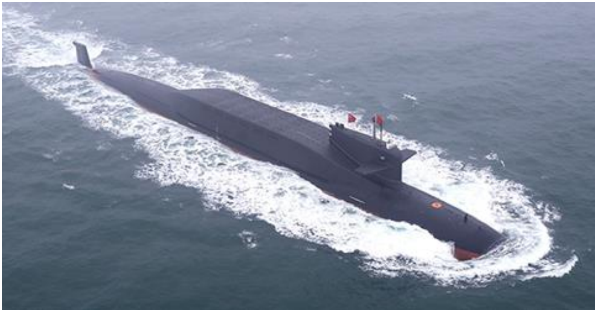
Figure 9. Jin (Type 094) Ballistic Missile Submarine (SSBN)