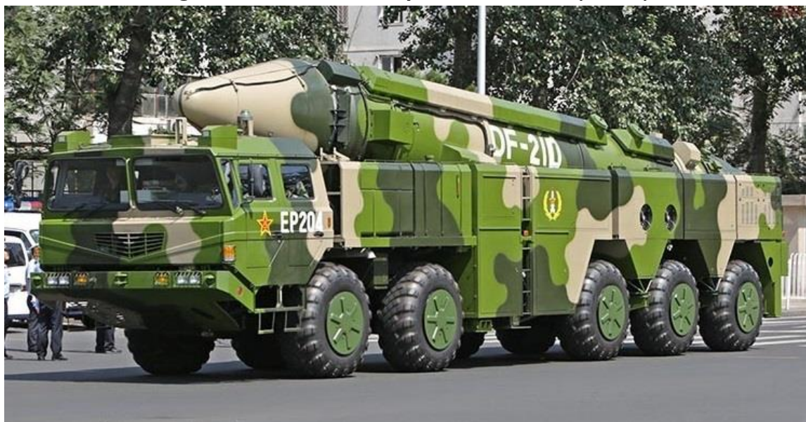
Figure 1. DF-21D Anti-Ship Ballistic Missile (ASBM)