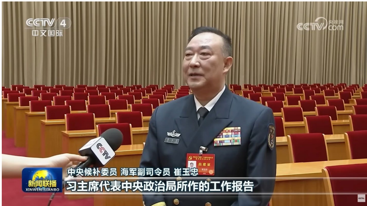
Figure 6: VADM Cui Speaks on the PLAN's Importance and Improvements Under the CCP-CC's Leadership.