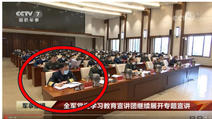
Figure 3: VADM Cui (circled in red) attends a lecture on Party history. Note Wang Xiubin (王秀斌) and He Weidong (何卫东) sitting at the same table. Both Wang and He were removed for disciplinary violations and corruption in October 2025. 27

Cui next appeared publicly in March 2021, in a leadership billet in the Eastern Theater Command (based on his seating position, chest badge, and arm patch), having been promoted to VADM. 26 This is the first observation of Cui serving in a joint billet.