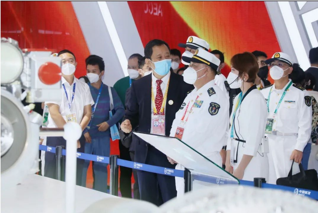
Figure 4: VADM Cui (wearing a red ID badge) visits the Aero Engine Corporation of China's display at the 14th Airshow China.

As a loyal CCP member in a senior-grade billet, Cui was also given other political roles. In October 2022, Cui was elected as an Alternate Member to the CCP's 20 th CC. 35 Alternate Members are standby personnel who fill vacated posts within the CCP-CC when its Full Members can no longer serve. PLA officers who serve as Alternate Members often receive grade and rank promotions later in their careers. One month later, Cui was announced as a member of former paramount leader Jiang Zemin's (江泽民) Funeral Committee. 36 Political positions like these indicate further trust and show steady political growth.