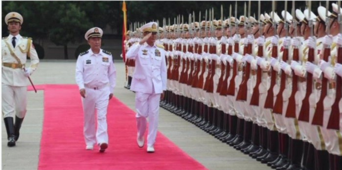
Figure 5: VADM Cui (left) and Commander-in-Chief (Navy) Admiral Htein Win of Myanmar (right) review the PLA Navy Honor Guard in Beijing.

As a deputy commander, Cui was in a better position to meet with foreign counterparts than ever before. In September 2025, VADM Cui received a Myanmar Tatmadaw (Navy) delegation led by Commander-in-Chief (Navy) Admiral Htein Win in Beijing. Typically, the PLAN Commander is the one who receives other navies' commanders, but in this case, Hu Zhongming was not present—it was Cui who did the honors. During the visit, Admiral Htein Win reviewed a PLAN Honor Guard and the two sides had a meeting on cooperation and training between the two navies. Admiral Htein Win also visited the Northern Theater Command Navy destroyer Xining (西宁舰) and the Naval Submarine Academy (海军潜艇学院) in Qingdao, Shandong province. 37 This may have been the first clear indication that Cui was slated for a higher grade.