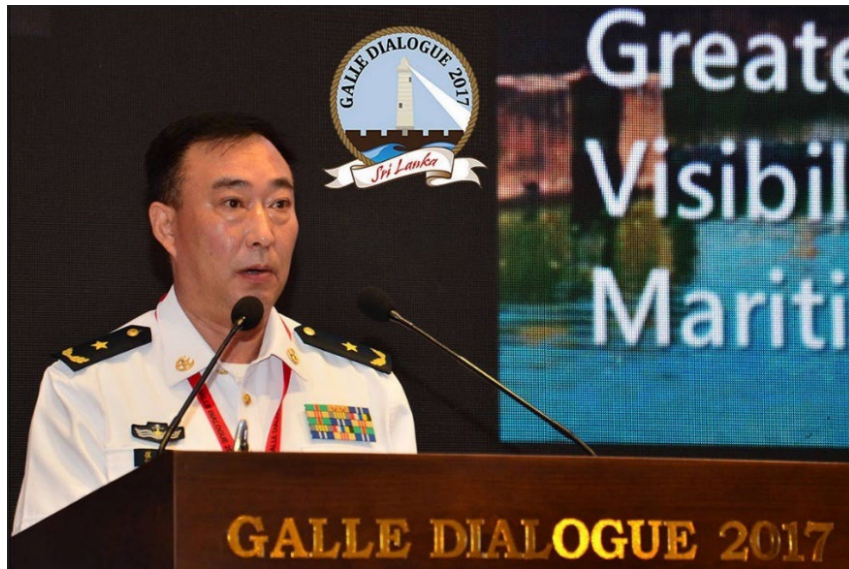
Figure 2: RADM Cui presents at “Galle Dialogue-2017” in Colombo, Sri Lanka. 25

Cui next appeared publicly in March 2021, in a leadership billet in the Eastern Theater Command (based on his seating position, chest badge, and arm patch), having been promoted to VADM. 26 This is the first observation of Cui serving in a joint billet.