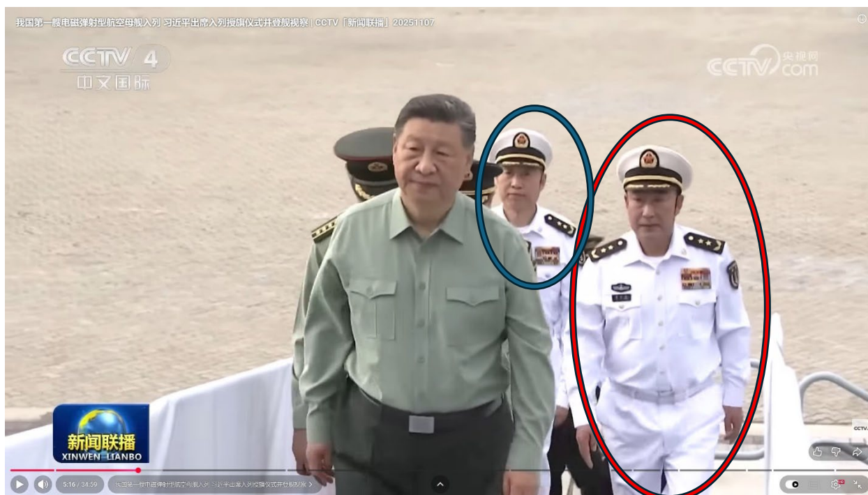
Figure 1: VADMs Cui (circled in red) and Leng Shaojie (circled in blue) accompany Chairman Xi up the brow to Fujian .

The high-profile appearance of Cui at the PLAN’s watershed milestone could indicate that Cui is slated to assume the highest PLAN billet.